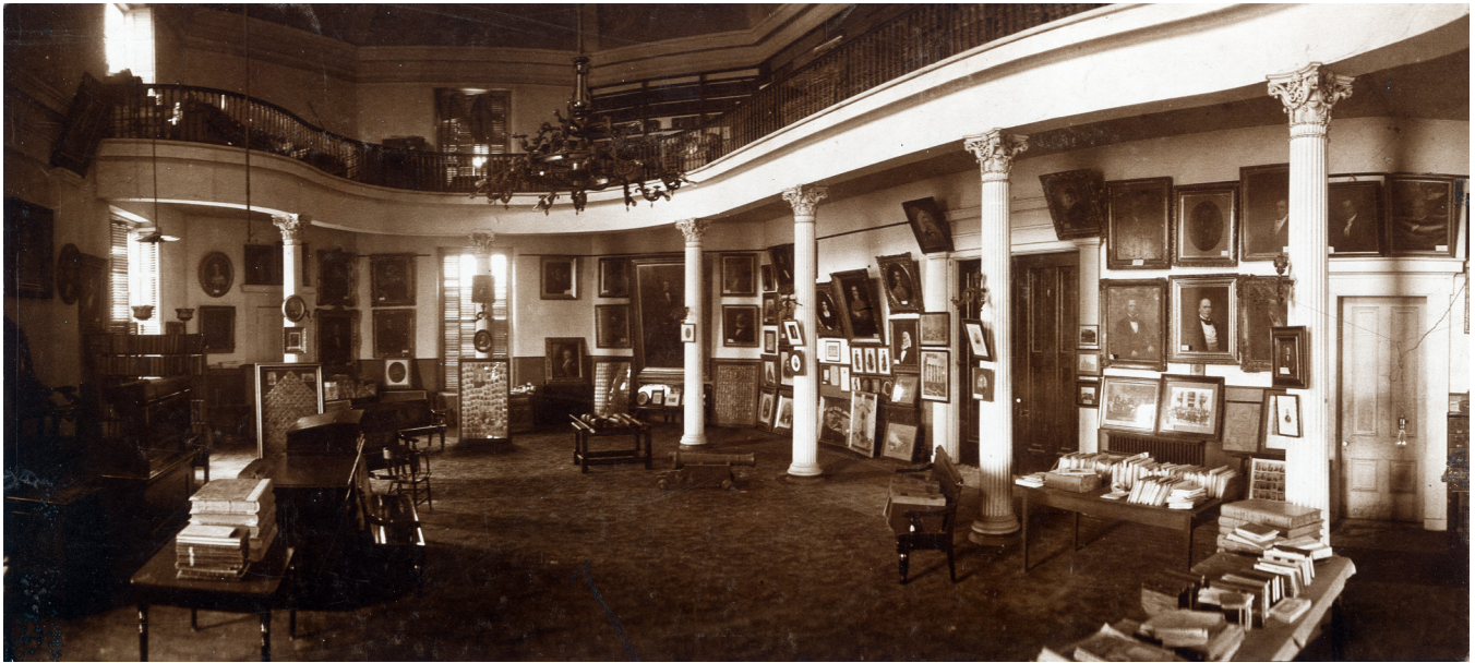
Collections of the Archives on view in the Senate chamber

and the American Historical Association both recognized Owen for his trailblazing work in the professionalization of state history and records preservation.